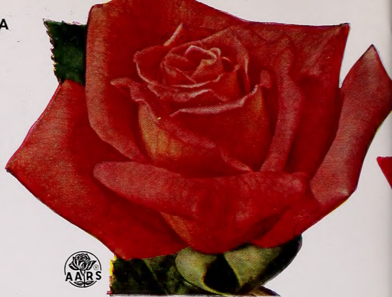
MOJAVE Pat. 1176 $2.75